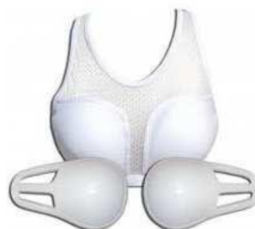
CHEST PROTECTOR FOR GIRLS