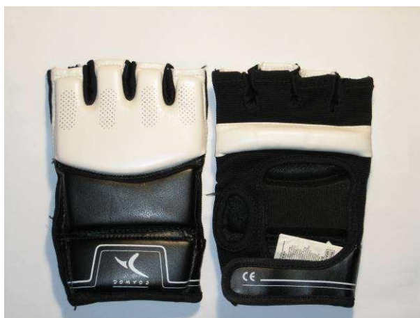
GLOVES (FROM 14 TO 17 YEARS OLD)

Another type of protections will be allowed if they offer the same level of protection.