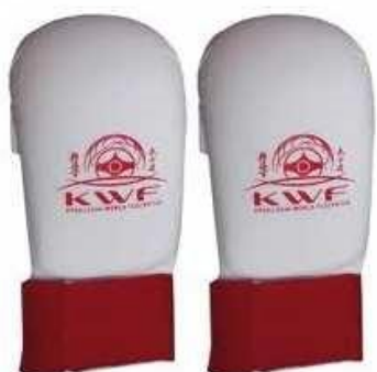
GLOVES (FROM 12 TO 13 YEARS)